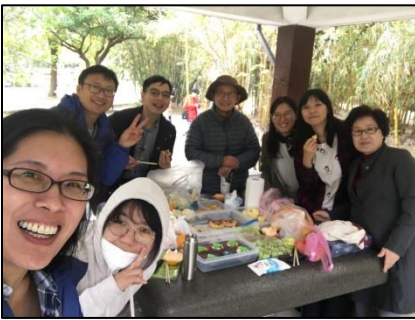
Christmas Team Outing