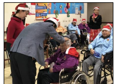
Visiting the senior citizens' home for Christmas.

4. CGN TV (Christian Global Network Television) will introduce Sanwan church and it will be broadcasted in Korea on January 27 th . Please pray that all those who watch the show will come to a greater understanding of the Hakka people and desire to participate in Hakka missions.